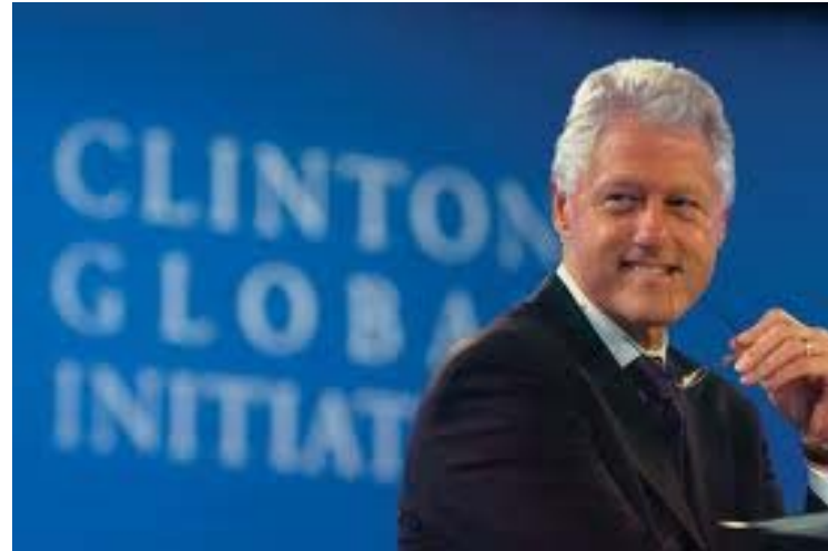
Clinton Global Initiative America (June 2011)

Do we have a structural mismatch between skills and jobs?